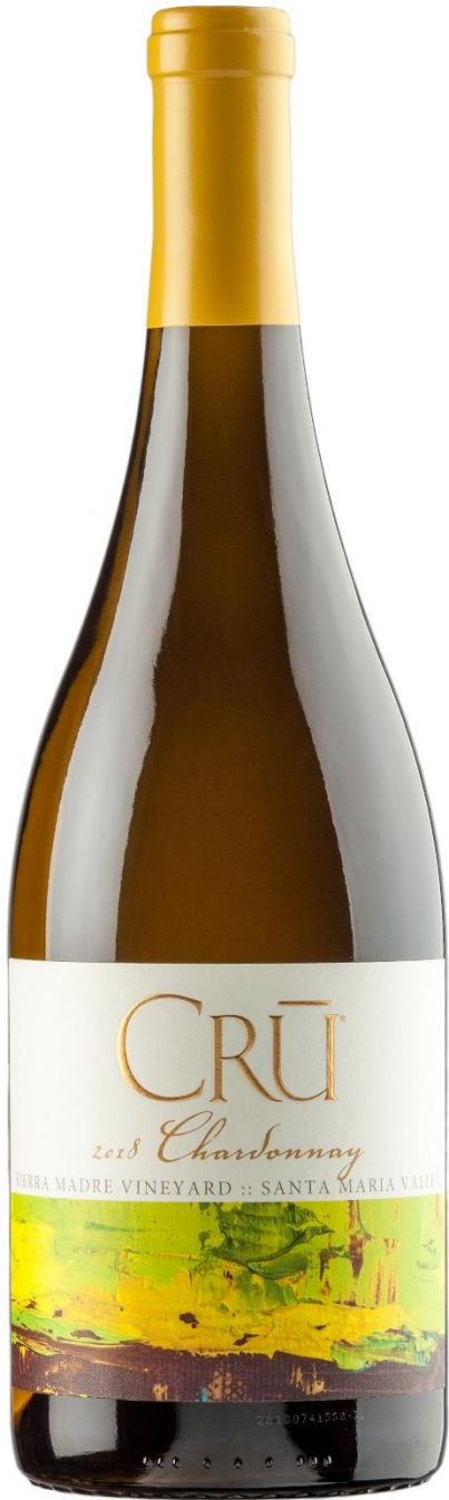
CRU® is a registered trademark of CRU Winery (a DBA of Mariposa Wine Co.)